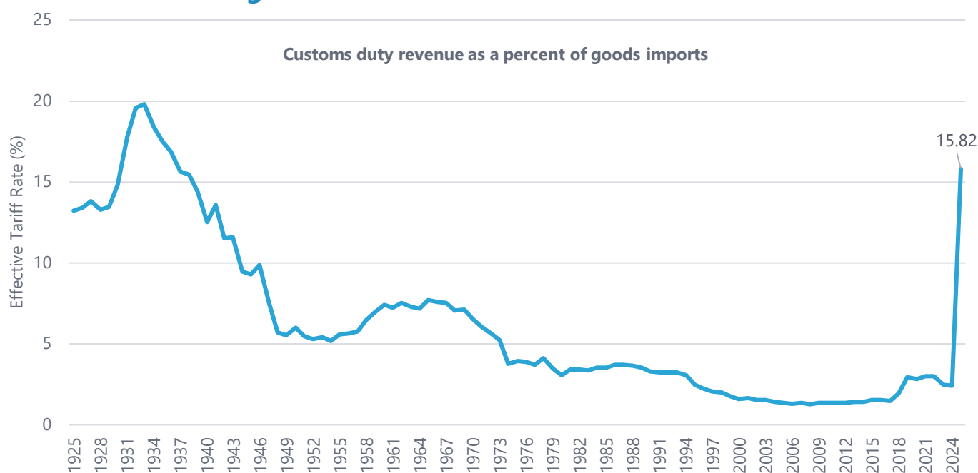
Exhibit 1: U.S. average effective tariff rate since 1925